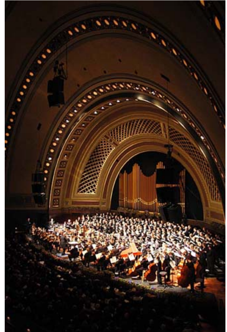
University Musical Society, MI