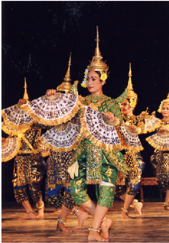
The Spirit of Cambodia