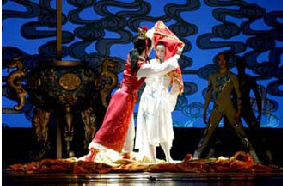
Shanghai Dance Company, China

2002 Survey: 75% Presenting Foreign Artists