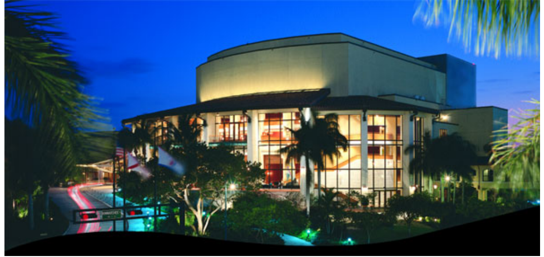
Broward Center for the Performing Arts, Florida

We envision a world where all people can experience the transformative power of live performance.